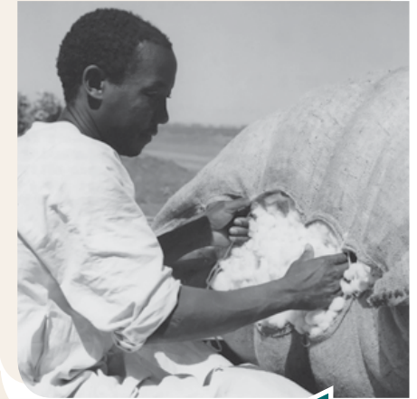
Sudan, 1962 - A man prepares a large bag of cotton to be sent for processing at a nearby ginnery in the Gezira plains of Sudan.