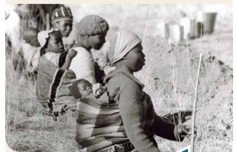
Lesotho, 1971 - Women with babies on their backs are planting trees as part of an effort to prevent land erosion.