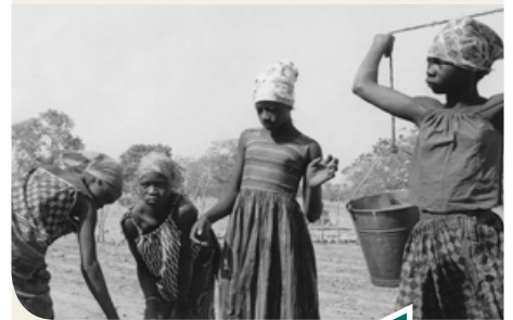
Upper Volta (now Burkina Faso), 1970 - Girls draw water for the irrigation of their plot of land in a Rural Education Centre.